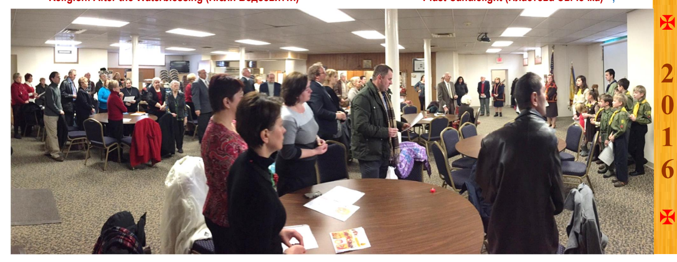
Plast Candlelight (Пластова Свічечка) --,