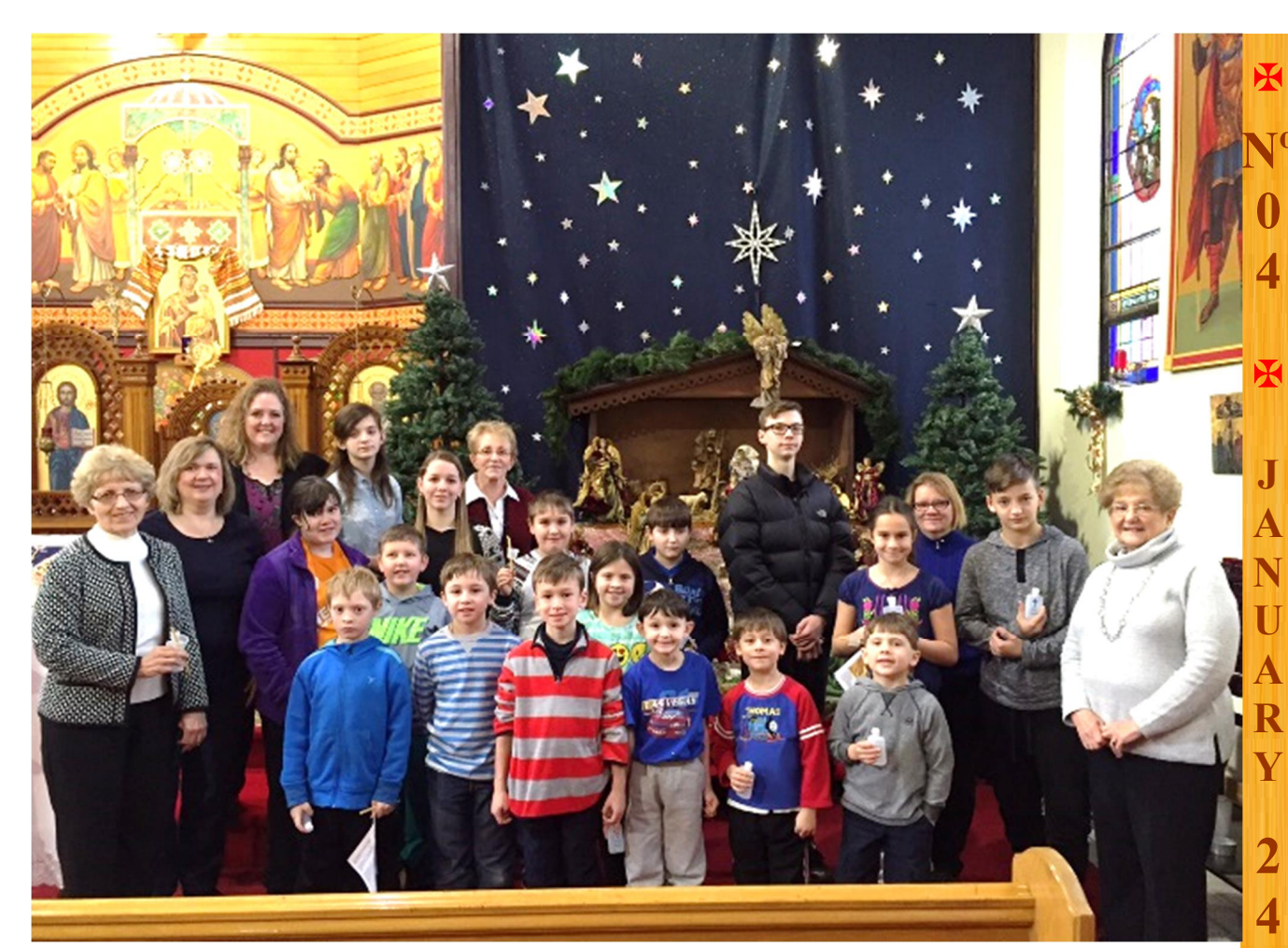
Religion: After the Waterblessing (Після Водосвяття) --^