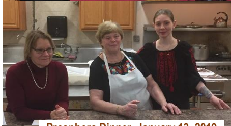
Prophora Dinner, January 13, 2019