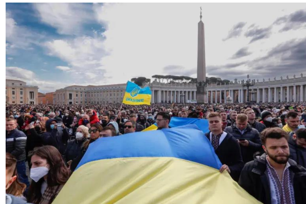
НА ПЛОЩІ СВ. ПЕТРА, РИМ, ІТАЛІЯ--AT ST. PETER SQUARE, ROME, ITALY