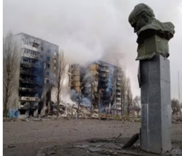
Taras Shevchenko – Symbolically bows his head to the burned buildings. not design of the artist but Design of life.

Many Happy Years! На Многая і Благая Літа!