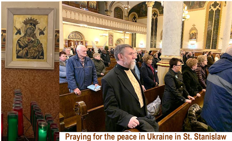
Praying for the peace in Ukraine in St. Stanislaw