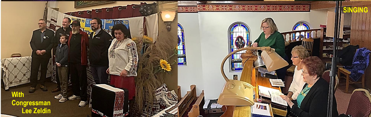
With Congressman Lee Zeldin