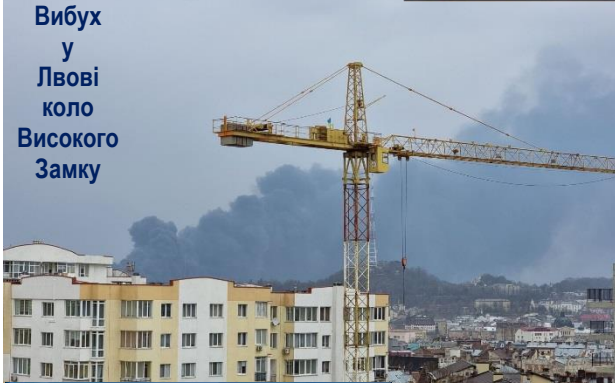
Вибух у Лвові коло Високого Замку