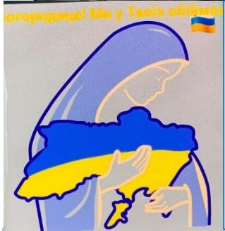
Богородице Діво, ми у Твоїх обіймах