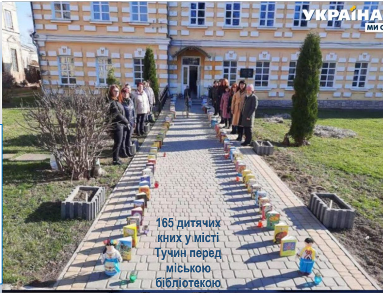
165 дитячих книг у місті Тучин перед міською бібліотекою