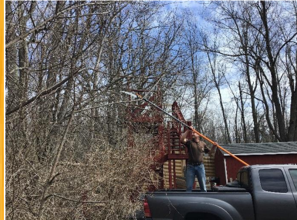
У Пошуках за лозою – Collecting the pussy willows.