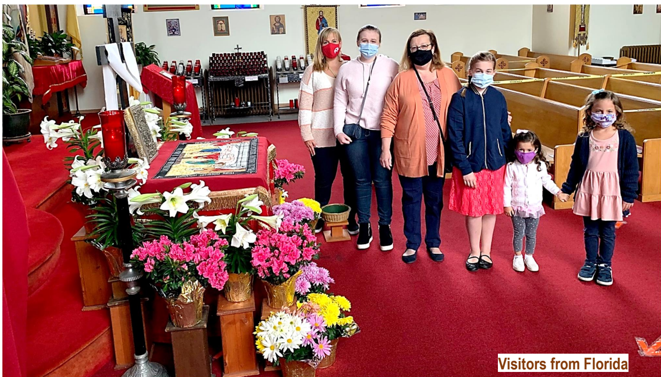
Visitors from Florida

If you have any photos from activity within your families and would want to share with us, please send us via E-Mail: