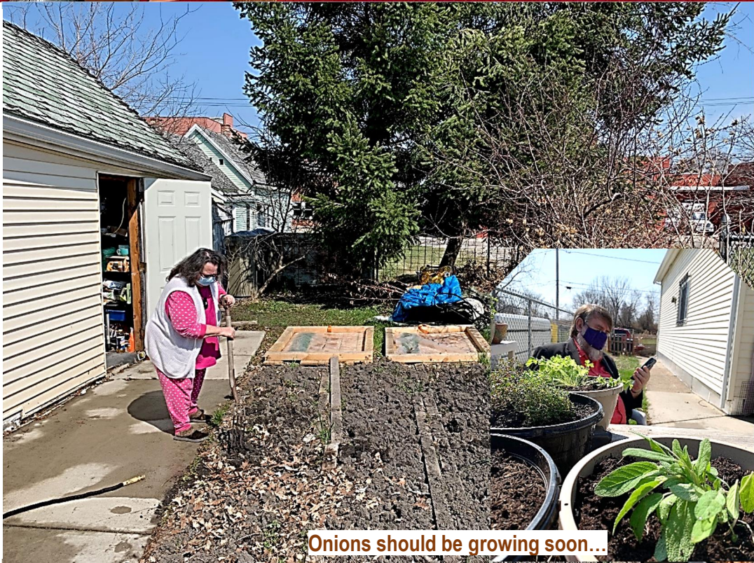
Onions should be growing soon...

Якщо маєте якісь найновіші родинні знімки, і хотіли би з нами поділитися, просимо вислати по Е-Майл. Дякуємо!