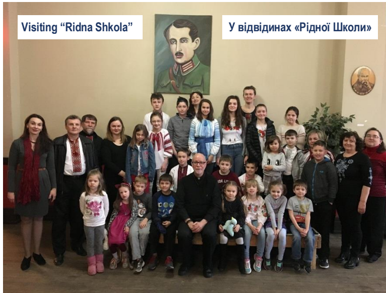
Visiting "Ridna Shkola"