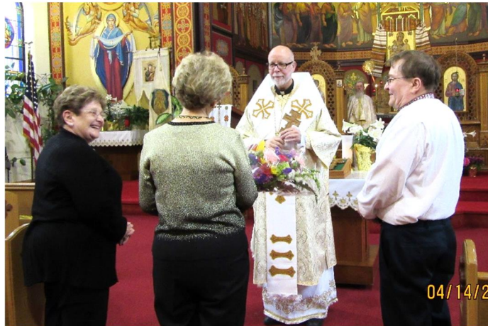
Сердечна подяка усім. Хай Господь благословить! Thank you for your presence and your help. May the good Lord bless us all!