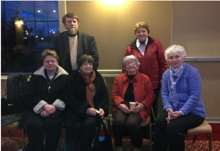
1st International Rosary, May 1 – St. John the Maron