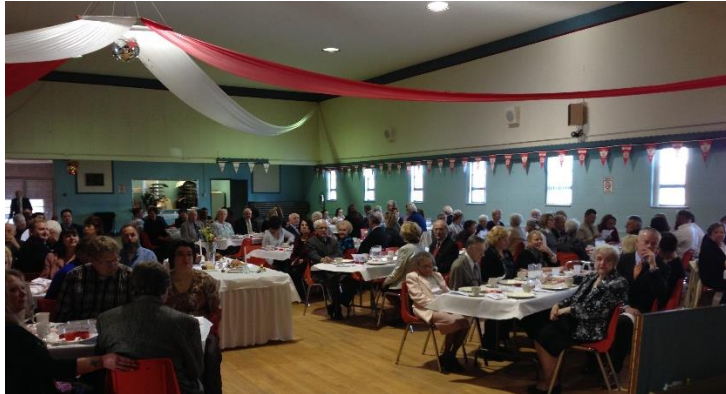
"Swieconka" Easter Dinner at St. Stanislaw, April 27.