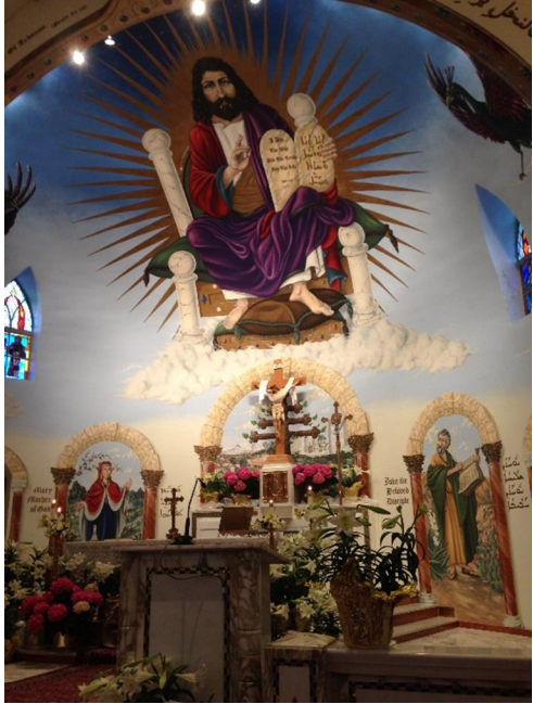
St. John the Maron Ch. – 1st International Rosary