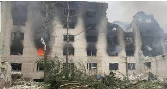
Lord, Bless Ukraine, bless all those who fight for freedom, Bless all those who suffer, who are wounded, who had to emigrate. Eternal memory to all those who were killed.