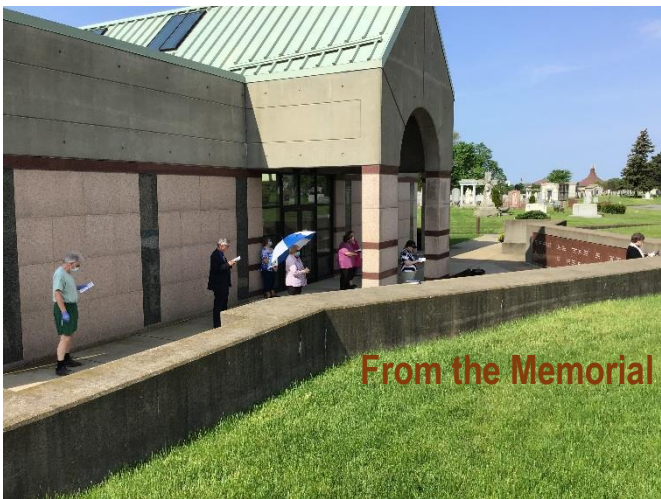
From the Memorial Day at Mt. Calvary