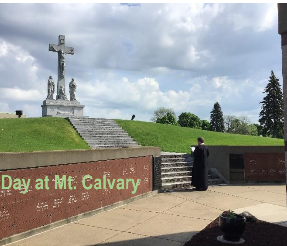
From the Memorial Day at Mt. Calvary