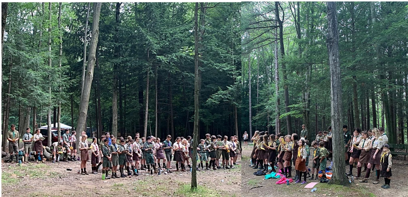
PLAST Camp – Пластова Оселя «Новий Сокіл»