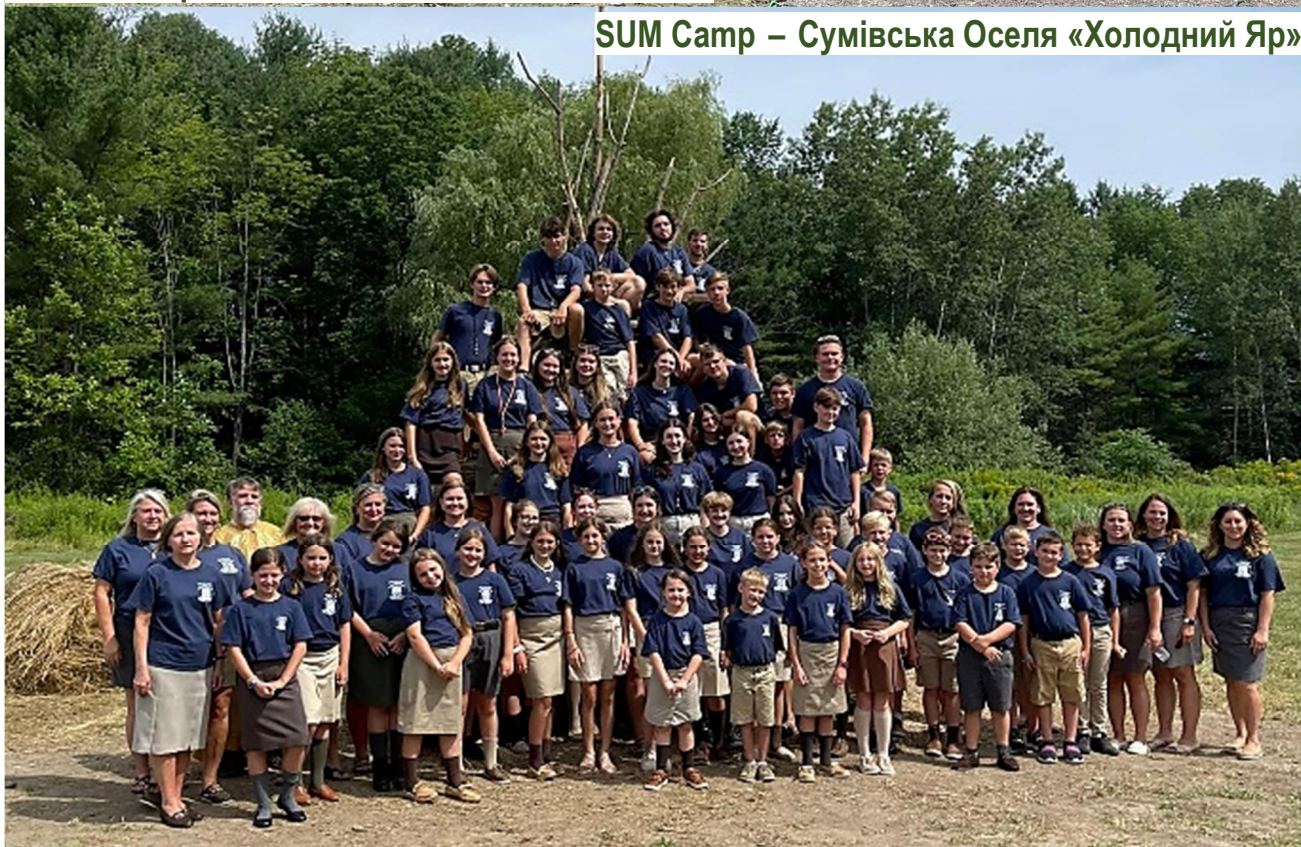
SUM Camp – Сумівська Оселя «Холодний Яр»

SAINT NICHOLAS UKRAINIAN CATHOLIC CHURCH