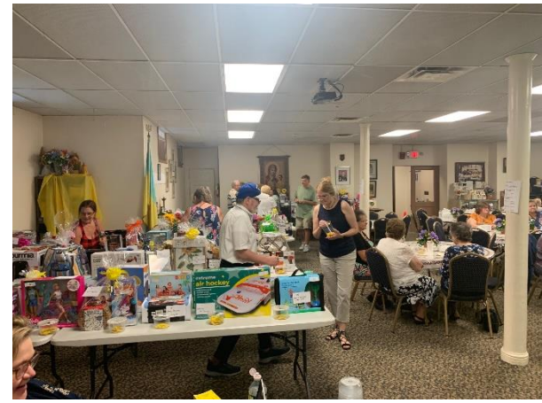
Here are some pictures from this year Church Picnic. Thank you for participating! God Bless you all!