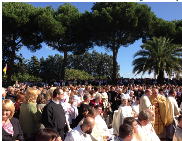
From my last year's visit to St. Sophia in Rome, Italy THANK YOU AGAIN FOR YOUR GENEROSITY! ДЯКУЮ!!!