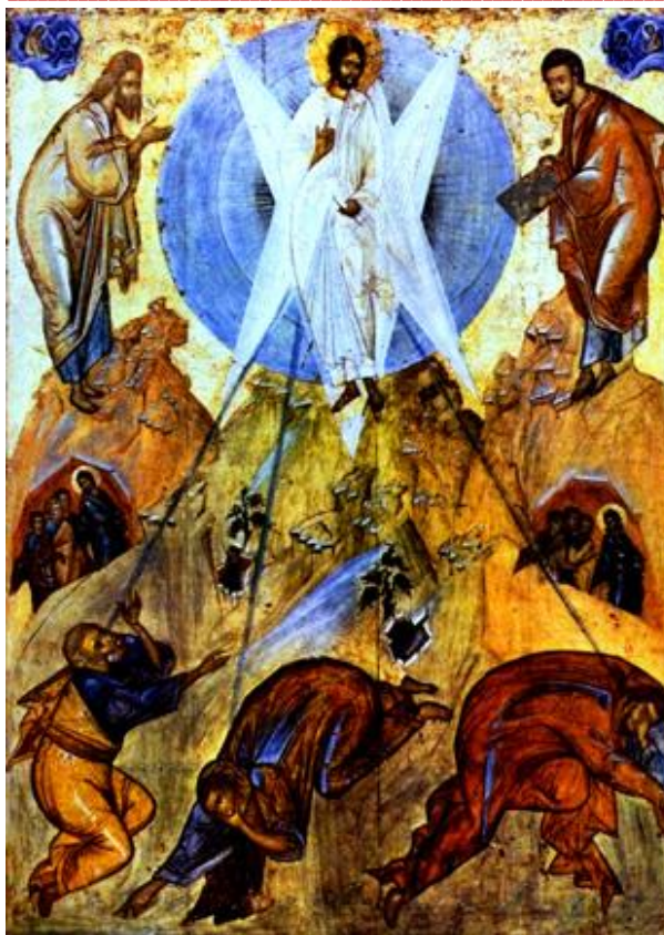
Переображення – Transfiguration (August 6 Gregorian or August 19 Julian)

August 18 – 2013 – 18 Серпня ЦЕРКОВНИЙ ВІСНИК