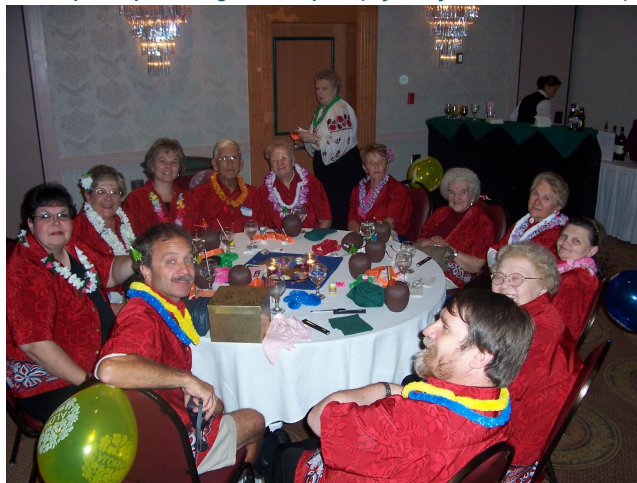
Preparing for LUC Convention in October (photo: 2004 Conv.)