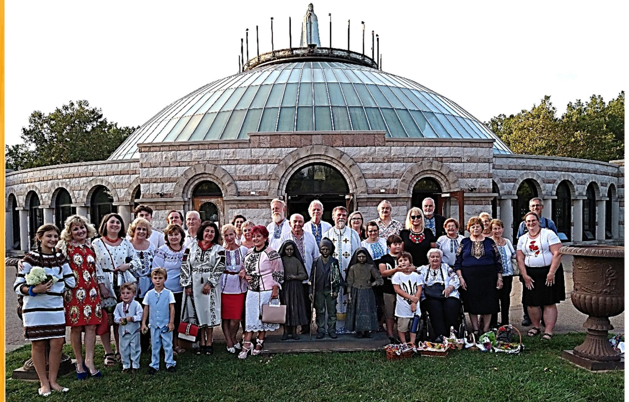
On Thursday, August 19 at the Fatima Shrine we celebrated Liturgy we remembered 88th anniversary of the day that the Ukrainian Catholic Youth League (UCYL), now known as the League of Ukrainian Catholics (LUC), was formed in Chicago in 1933. У четвер, 19 серпня, на Переображення, була віслужена Свята Літургія у Фатіма. При тій нагоді згадували 88 років Ліги Українців Католиків. Многая і Благая Літа!