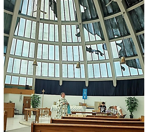
Photos from Fatima will be in next bulletin. Thank you for coming to pray with League of Ukrainian Catholics. Знімки з Фатіми будуть у наступному бюлетені. Дякуємо усім, що прийшли помолитися з ЛУК у 88 ліття.