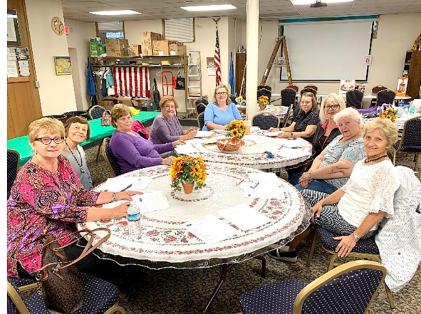
Meeting of Anniversary Committee – Засідання комітету