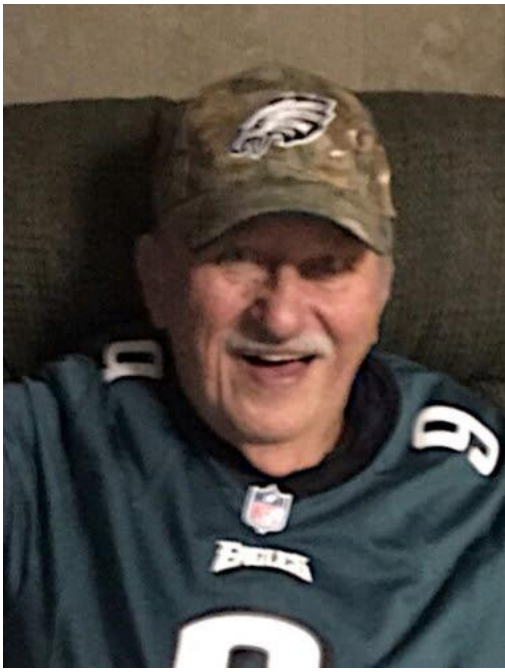
Eternal Memory! Vichnaya Pamiat'!