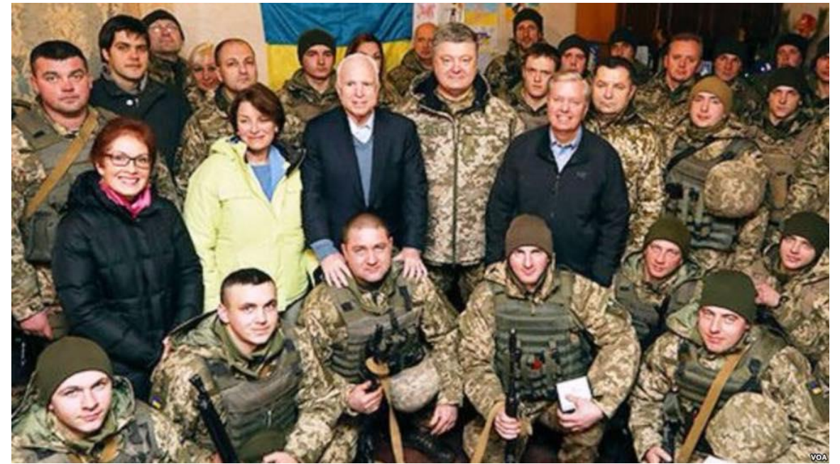
This photo was taken on the New Year's Eve 2016. Senator John McCain traveled to the Eastern Ukraine to lift up spirits of the Ukrainian soldiers. He didn't seek to gain votes or popularity. He was just a good man who wanted to help those in need. Rest in Peace Senator McCain. Vichnaya Pamyat!

Ласкаво вас просимо відвідати нашу сторінку "www.novyisokil.org"