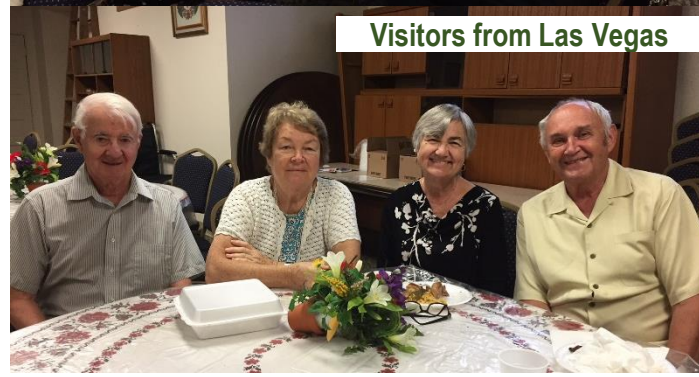
Visitors from Las Vegas