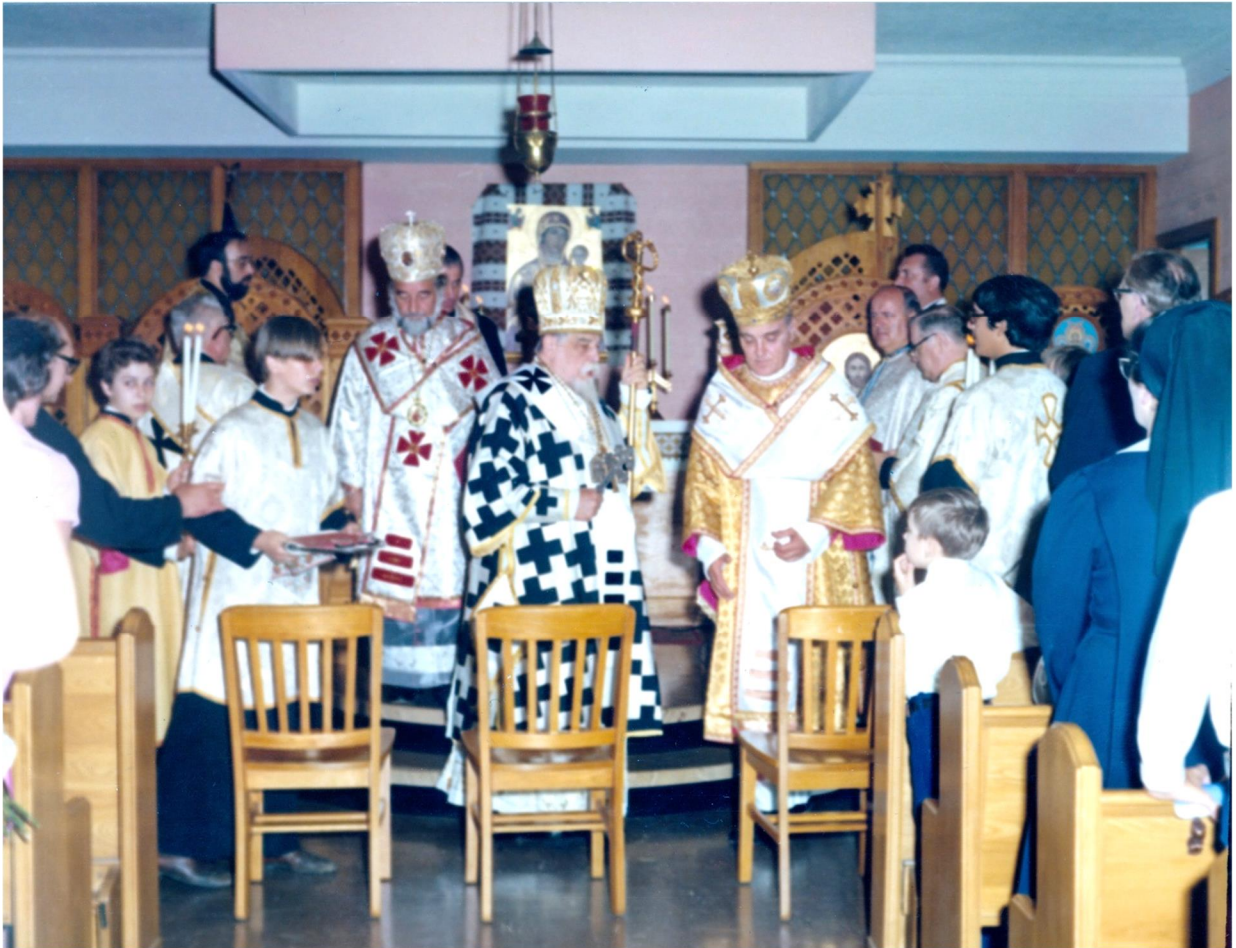
Зі Святими упокой, Христе, душу слуги Твого Патріярха Йосифа (+7 Вересня, 1984 Р. Б.) Patriarch Josyf Slipyj visiting our Parish. * (+September 7, 1984 – Eternal Memory! Вічна Пам'ять!)