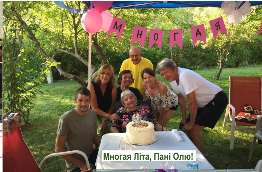
Многая Літа, Пані Олю!