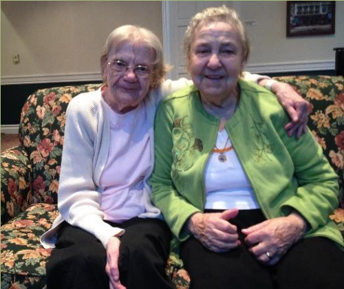
2 best friends (can you tell?) – Найкращі приятельки