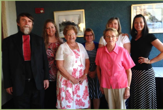
This year's Catechists – Наші Катехитки 8/21/2014