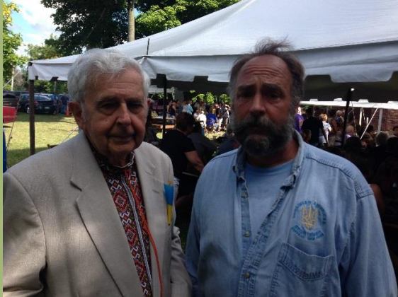
On Ukrainian Day, August 24 – На Українському Дні