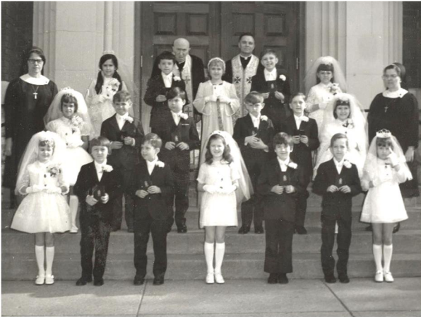
From last Bulletin: (Photo No. 34)