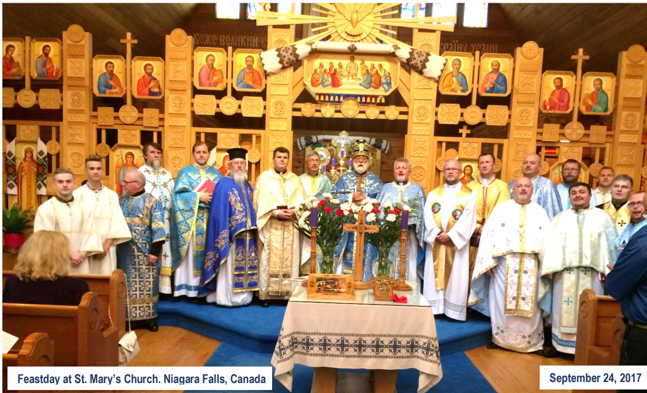
Feastday at St. Mary's Church. Niagara Falls, Canada