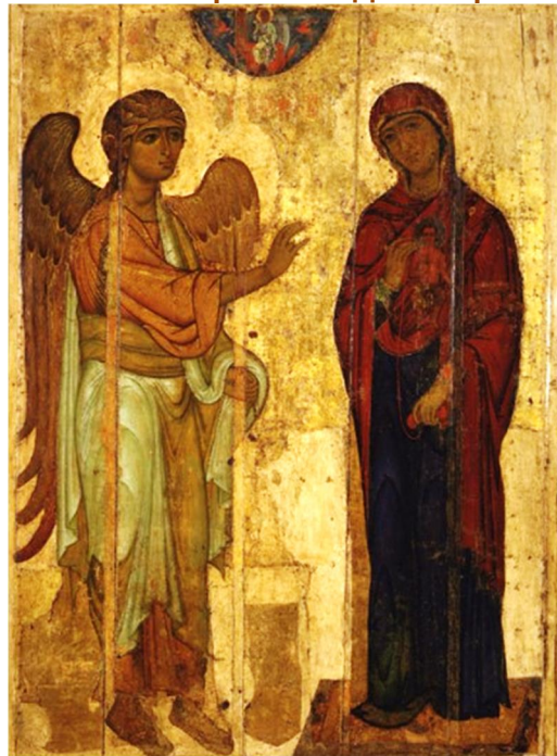
Зачаття Ісуса Христа (Благовіщення)