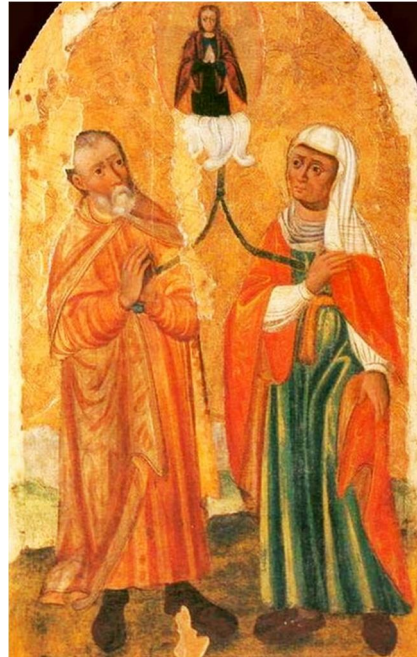
Зачаття Пречистої Діви Марії