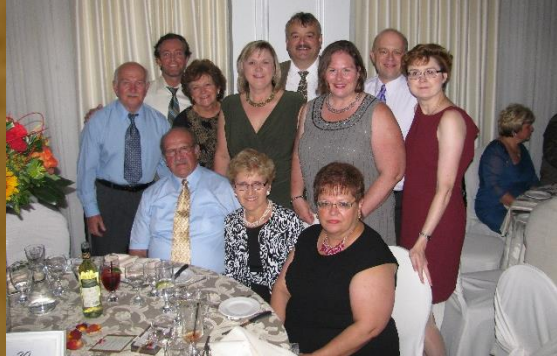
From Babicky's Wedding in Canada