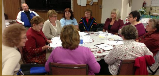
Preparing for the LUC 75 th Convention