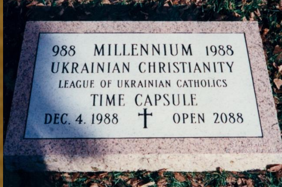
LUC Time Capsule was buried 1988 in Philadelphia near our Cathedral. Will LUC last until its opening? If we implement vision 20/20 now, LUC will be vibrant in 2088 and beyond.