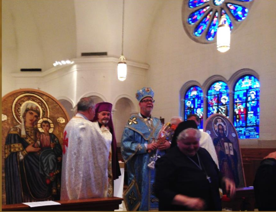
At the end of the Liturgy: Clergy Days at Mt. Alvernia