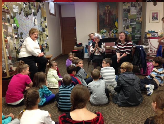
Ridna Shkola – Religion, St. Nicholas Church Hall, 10/19/2013