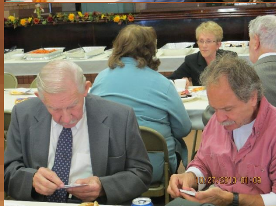
What is s-o-o-o interesting?