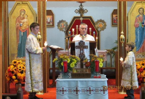
LUC Sunday – Lackawanna – October 26, 2013