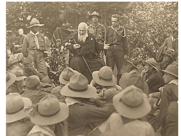
Митрополит Шептицький в пластовому таборі, 1929 рік

Захід відбувається сьогодні, 5-го листопада у церковній залі по завершенні Служби Божої. Щиро запрошуємо взяти участь!