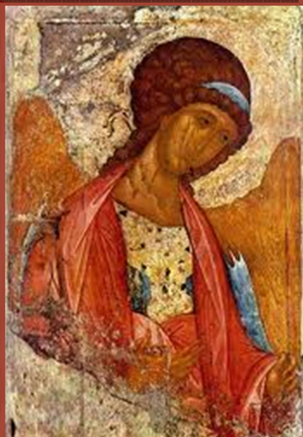
Св. Архангел Михаїл – St. Michael Archangel

CHURCH BULLETIN November 17 – 2013 – 17 Листопада ЦЕРКОВНИЙ ВІСНИК